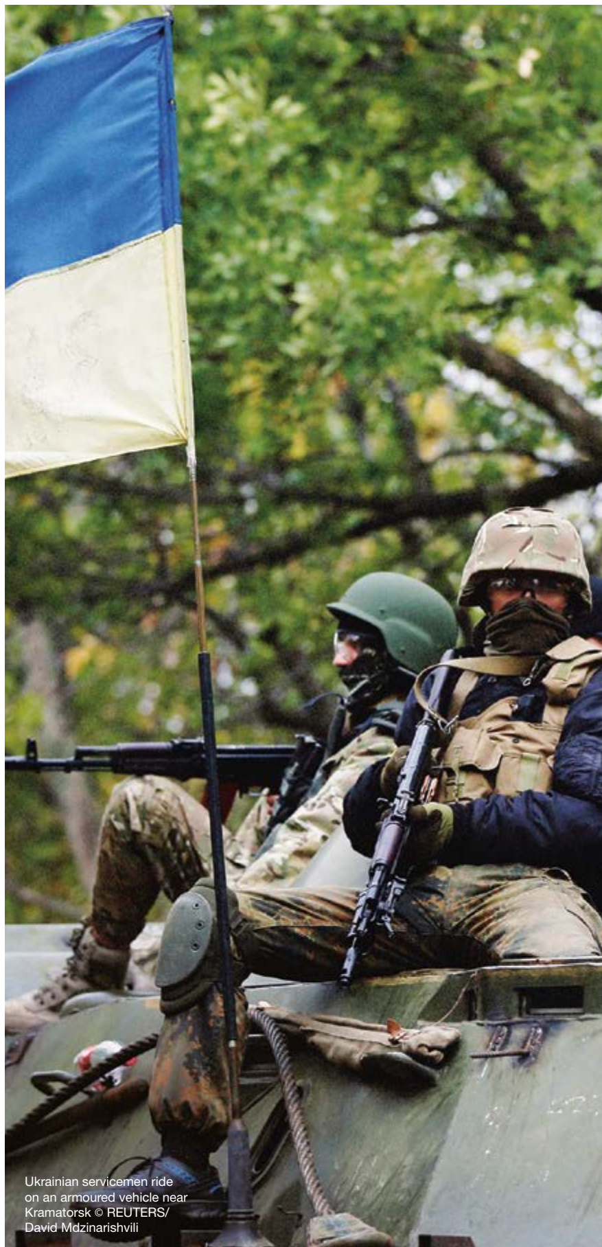
Ukrainian servicemen ride on an armoured vehicle near Kramatorsk

“A continued internal authoritarian and external revisionist course would obviously continue to place severe strain on the