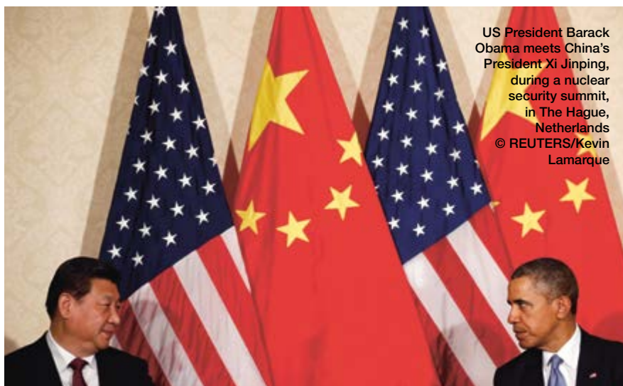
US President Barack Obama meets China's President Xi Jinping, during a nuclear security summit, in The Hague, Netherlands

relationship," he says, "while a return to the modernization and integration course at least partially attempted before 2012 would bring new opportunities."